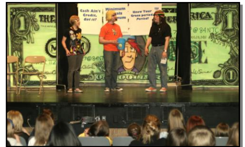
Scene from: Crazy About Credit

Crazy About Credit features two professional actors who play a variety of characters in a 40-minute program. Students learn about financial literacy through four comical and informative sketches. At the beginning of each scene, actors interact with the audience and get information that will be used during the sketch, such as their favorite band or something they always dreamed of having. This information is interjected into the show and may even be the point of a scene or the basis of a character