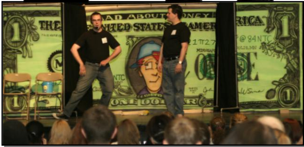
Scene from: Crazy About Credit