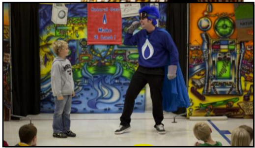
Scene from Adventures of the Blue Flame