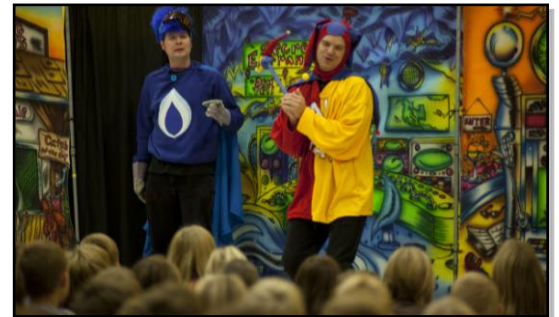
Scene from: Adventures of the Blue Flame

The Adventures of the Blue Flame features two professional actors who play a variety of characters in the 25-minute program. Students learn about natural gas and energy efficiency while cheering on the play's hero, The Blue Flame who needs to stop an evil villain who is using natural gas unwisely all over town.